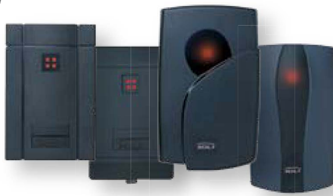
Arch, Linear, Curve, Wave