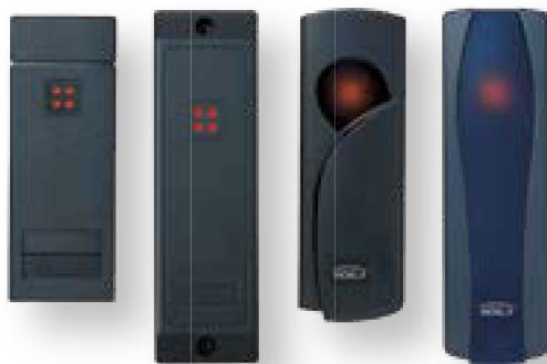
Arch, Linear, Curve, Wave

As with all Indala 125 kHz Proximity Readers, the Indala Standard Proximity series includes FlexSecur® technology. With a read range of up to five inches, Indala Standard Proximity readers are suitable for a variety of applications. All Indala Standard Proximity readers use the same Indala core module, and are available in three popular form factors: Mullion (Slim), Wallswitch, and Classic, and several designs including Arch, Linear, Curve, and Wave.