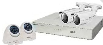
QH-D1104AC-1 & QH-D1104AC-3